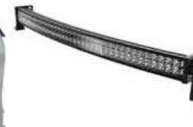
42IN DUAL ROW CURVED LED LIGHT BAR (654073)