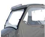
FULL WINDSHIELD (682913)