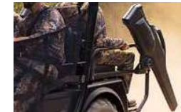
LEFT GUN BOOT MOUNT (668264G01)