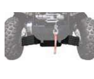
STICK STOPPER KIT (639841)