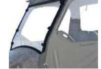
FULL WINDSHIELD (668486)