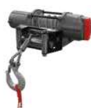
WARN 4000 LB. WINCH WIRE (751267PKG)