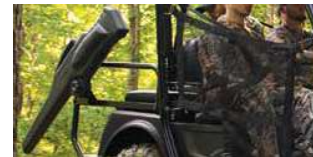
RIGHT GUN BOOT MOUNT (668264G02)