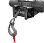
WARN 4,000LB WINCH WIRE (751267)