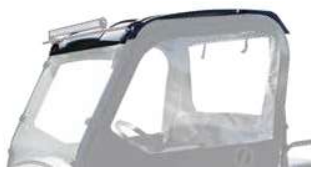
PLASTIC CANOPY (682611)