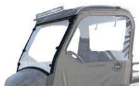
FULL WINDSHIELD (682913)