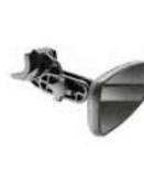
REARVIEW MIRROR (651489)