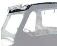
PLASTIC CANOPY (682611)