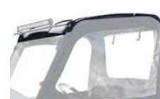
CANOPY KIT (668077)